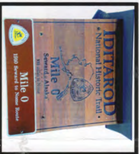
E. Mile Zero