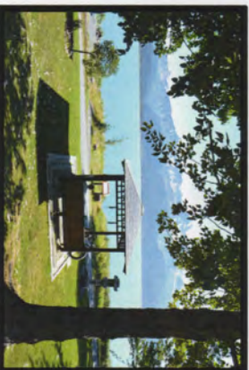
G. Japanese Gazebo