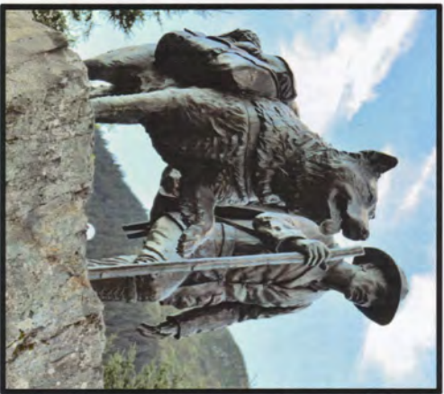
A. Trail Blazers