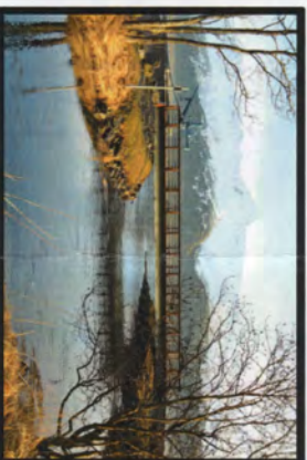
H. Scheffler Creek Bridge